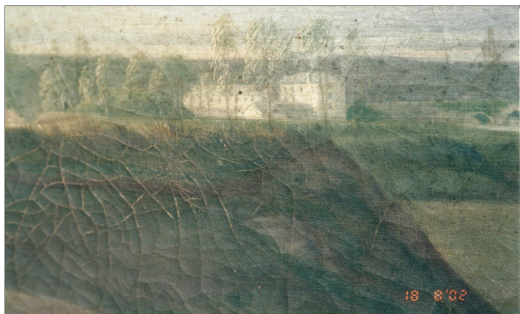
The 2 storey building to the left of the 4 storey mill is the Miller's House